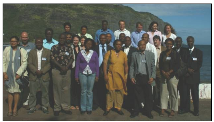
Fig. 3.1 Key ASCLME country representatives at Reunion meeting

The Node manager is the South Africa Data and Information Coordinator for the ASCLME. This involves attending numerous meetings (Grahamstown, Mauritius and Reunion for the WIOMSA meeting), coordinating the South Africa marine ecosystem diagnostic assessment (MEDA) and generally working closely with the ASCLME with regards to monitoring, research and capacity building in the SW Indian Ocean. SADCO is also involved in a data archiving capacity. The MEDA forms the basis for the contribution of each country to the Transboundary Diagnostic Analysis and hence the Strategic Action Plan. The South African MEDA is a 200 page document capturing essential information relating to the marine and coastal dynamic biophysical processes, including data information, gaps and needs. The SA MEDA has yet to be finalised but will be complete before the end of 2010. Numerous opportunities (in particular, the Nairobi Convention Clearing House and the Marine Atlas, see sections 7 and 8) have arisen from this partnership and it is hoped that this will be ongoing. Through work within the ASCLME the Node's network has expanded and many excellent contacts have been made with key East African scientists.