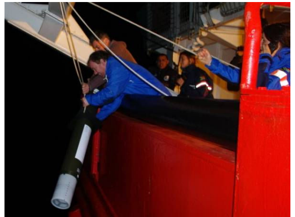
Fig 2.1: Argo float being deployed from the Agulhas